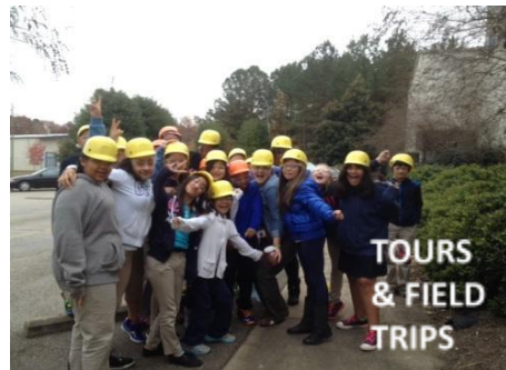
TOURS & FIELD TRIPS

Green School documentation is due by April 30 th each year