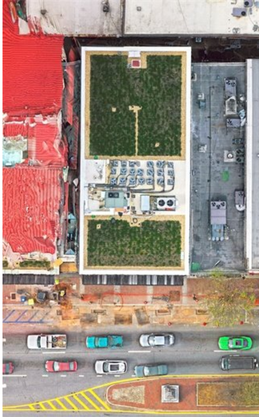
In 2021, the Stormwater Management Program recognized the Green Roof System on top of Target in downtown Athens, designed by Smith Planning Group and grown by James Greenhouses