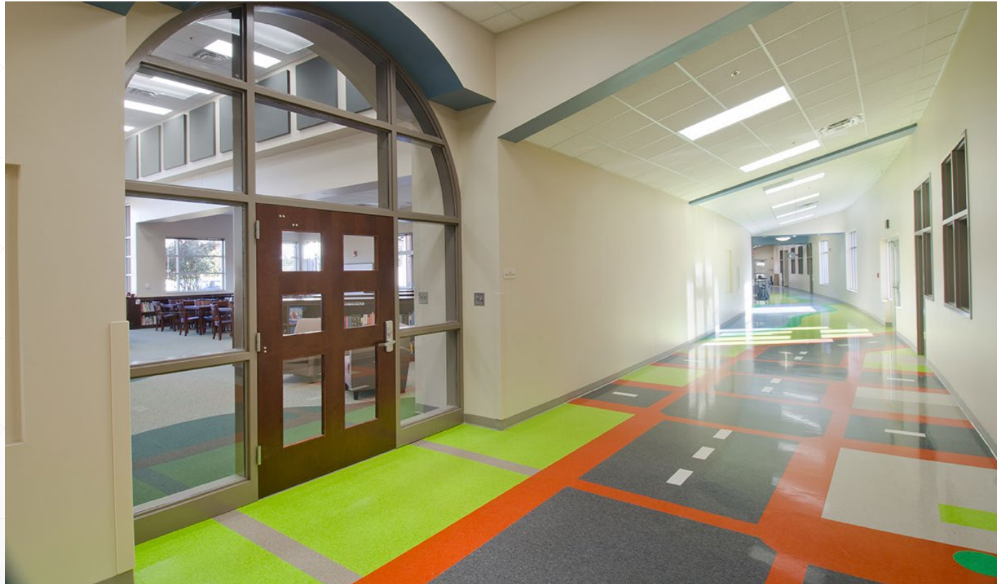
Fowler Drive Elementary School