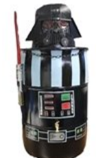
"Dark Side of the Rain" by Lorenza "Chico" Rozier