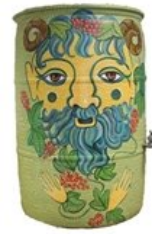
"Bacchus" by Cameron Bliss