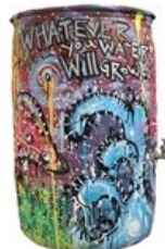
"Ride the Wave" by Cody Fortson