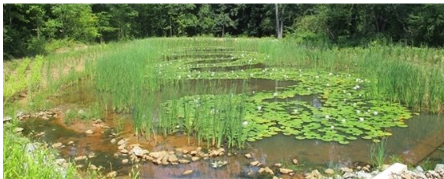
The Stormwater Management Program recognized Armentrout, Matheny, Thurmond P.C. and McLane Company in 2020 for their engineered pocket wetland, pictured above.

Applications are due on Monday, March 1, and winners will be honored at the annual Green Life Awards in April.