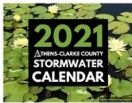
This year's cover photo was taken by Sue Lawrence.