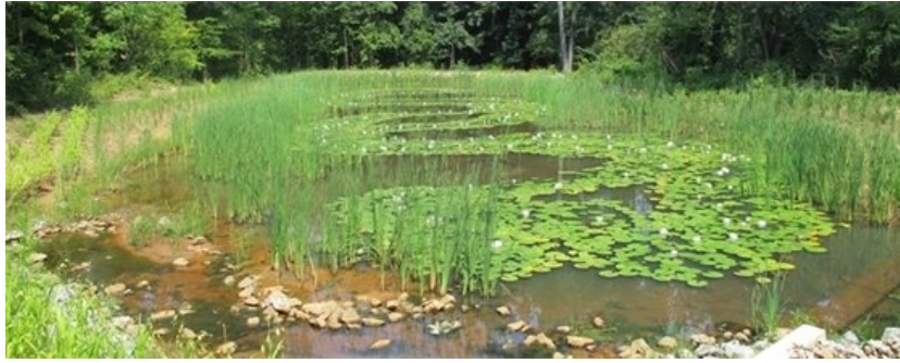
The Stormwater Management Program recognized Armentrout, Matheny, Thurmond P.C. and McLane Company in 2020 for their engineered pocket wetland, pictured above.

Applications are due on Monday, March 1, and winners will be honored at the annual Green Life Awards in April.