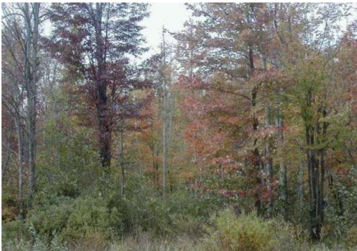
Newly established future forest areas may appear dense and aesthetically displeasing.