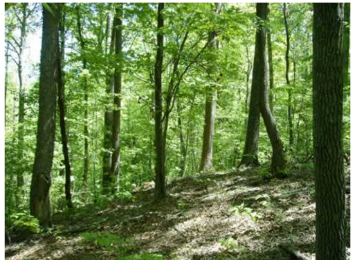
Eventually the strongest trees survive and a pleasant forest is created.