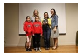
The Alice H. Richards Children's Garden at the State Botanical Garden of Georgia was recognized as our 2019 Stormwater Steward.

ACCGOV Stormwater is now accepting nominations for the 2020 Stormwater Steward Awards. The Stormwater Steward Award recognizes environmental stewardship in the area of stormwater management. Organizations, businesses, individuals, design firms, or community groups that have worked to consider the impact of stormwater runoff on the health of area waters through a specific project, practice, or