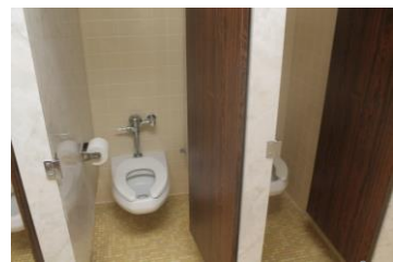
36 Replacement Fire Station 5