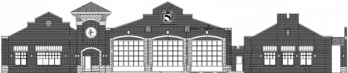
36 Replacement Fire Station 5