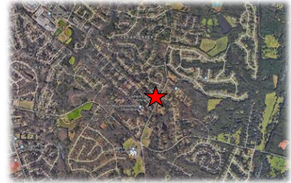
36 Replacement Fire Station 5