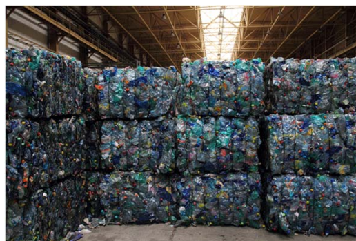
Larger covered area for baled material

49 - New Recovered Material Processing Facility