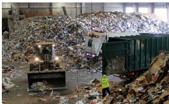
Larger covered tip floor for unprocessed material