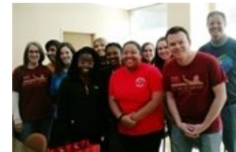
Volunteers who staffed a pop-up thrift store at Denney Tower with Project Safe.