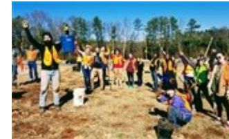
Planting daffodils along the North Ave. Loop 10 on/off ramps with Keep Athens-Clarke County Beautiful.