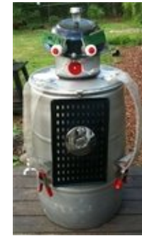
2012 barrel painted by Chico Rozier.