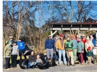
Volunteers at the Athens Area Homeless Shelter.

[https://www.facebook.com/pg/athensmlkdayofservice/photos/?tab=album&album_id=1338147029623318] .