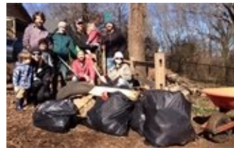
The Boulevard Woods group after cleaning up the park.