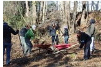
Volunteers cleaning up the grounds at the Acceptance Recovery Center.