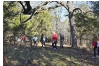
Beech Haven volunteers getting ready to plant some trees with the Athens Land Trust.