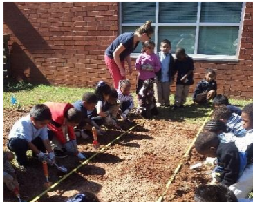
Outdoor Learning Spaces

Located at the CHaRM 1005 College Avenue Open Mon & Weds 10 am to 7 pm Saturdays 8 am to Noon