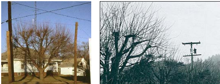
Figure 2. Examples of incorrect utility line clearance pruning.

In the past, utility company contractors would prune the least amount of material as they could. These contractors were often paid by the tree or by the mile for their work. This system resulted in pruning cuts that were often harmful to trees. It is often difficult to implement NTP in areas where substandard pruning has been performed. The trees in Athens-Clarke County are now having additional branches removed in order to correctly implement NTP. As these cycles continue, mature trees will adjust and young trees will be initiated to NTP methods. Eventually, utility line clearance pruning will become less noticeable and less damaging to our trees.