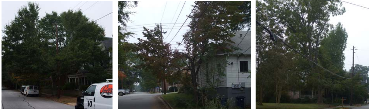
Figure 3. Examples of correctly performed natural target pruning.