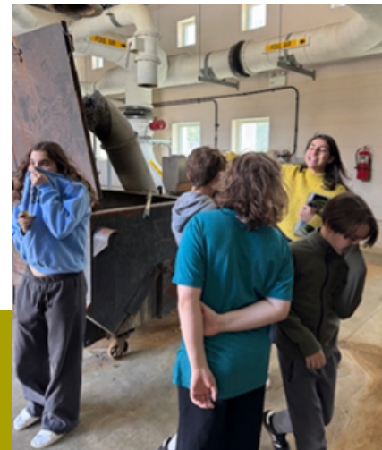
HEADWORKS SMELLS AT THE CEDAR CREEK WATER RECLAMATION FACILITY

So, what are some solutions to this trashiness? Of course, we promote the 4 Ps of Flushing so that instead of listing everything that shouldn't be flushed, we can state the only things that should be flushed: Pee, Poo, Paper, and Puke. However, that doesn't eliminate this trash from existing. Here are some sustainable solutions for our main offenders: