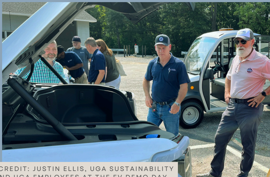
PHOTO CREDIT: JUSTIN ELLIS, UGA SUSTAINABILITY ACC AND UGA EMPLOYEES AT THE EV DEMO DAY

PUTTING ENERGY INTO GREENER SPACES Athens-Clarke County Sustainability Department